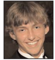
Alexander Fleming 12-4 ~ 5-8